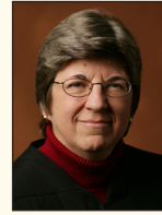
The Honorable Pamela White Associate Judge Baltimore City Circuit Court