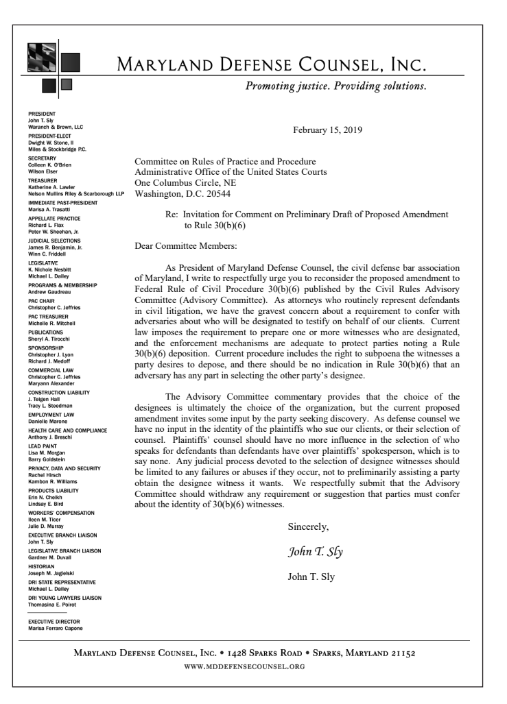
MDC's letter in opposition to Rule 30(b)(6) amendments